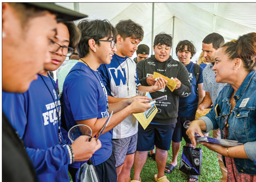
Top: Waimea High School students enthusiastically review the tourism and hospitality literature being distributed during the “Find Your Future” event on Friday, Feb. 23, 2024, at Kaua’i Community College.